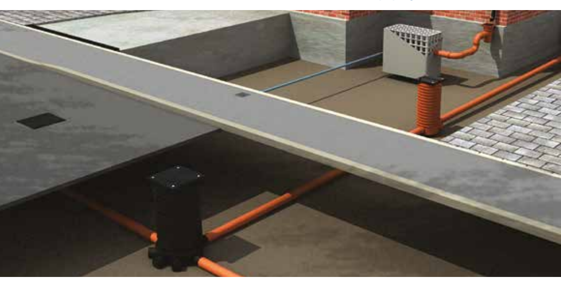
Trade Price List 2021 Rev 1