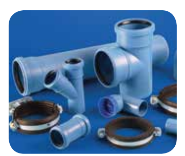
Terrain Acoustic dB12