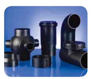
Terrain FUZE HDPE

The illustrations within the next two pages show the equipment required and how this is set up for testing a drainage stack. This document illustrates a single floor being tested, however it is also possible to test multiple floors of the same stack in one go. Whilst performing this test with appliances attached it is important to ensure that any traps connected to the system are filled with water.