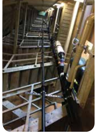
P.A.P.A. system testing at the National Lift Tower