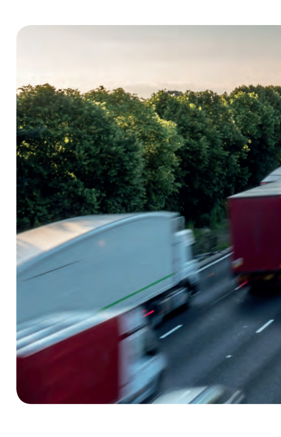
Highways Solutions The way ahead

Polypipe Civils and Green Urbanisation Charnwood Business Park North Road, Loughborough Leicestershire LE11 1LE Tel +44 (0) 1509 615100 Email civils@polypipe.com/civils