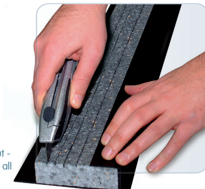
Simple to cut - one size fits all

Now available with corners and brick ties for superior fixing.